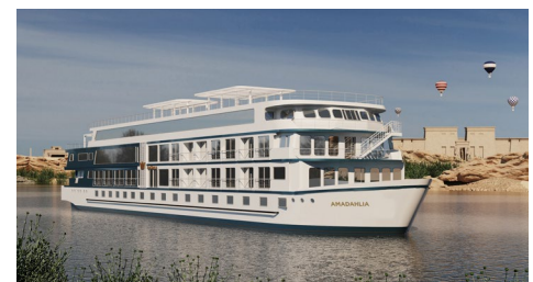
AmaDahlia Exterior Artist Rendering