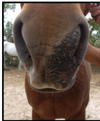
Texas equine case 2014

Confirmed cases of VS must be reported to interstate and international trading partners, which may result in restrictions, additional inspections or testing requirements. Prior to shipping livestock during a VS outbreak, check with the state of destination to ensure all entry requirements have been met. To obtain contact information for other states' animal health regulatory officials, contact the TAHC at 1-800-550-8242.