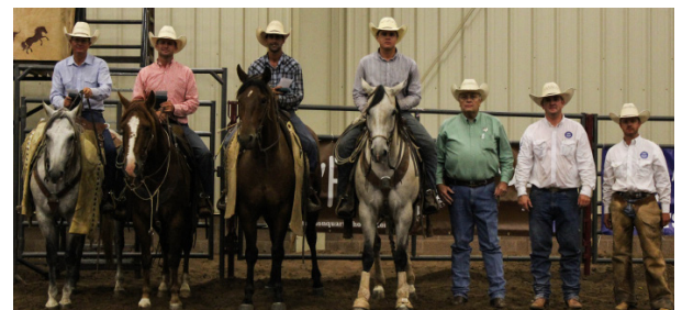
Sandhill Cattle Company, First Place Team

WILD-COW MILKING WAS THE DECIDING FACTOR IN WHICH team won the TSCRA Levelland Ranch Rodeo, July 18. The bronc riding, team doctoring and team branding competitions set up a 3-team showdown in the last segment.