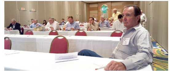
Sessions such as this meeting of the Marketing Committee addressed issues that could later become policies.

Join us in San Antonio Sept. 23 to 25 for the 2015 TSCRA Fall Policy Conference, where issues discussed at the Summer Meeting will get attention and possible development into association policy.