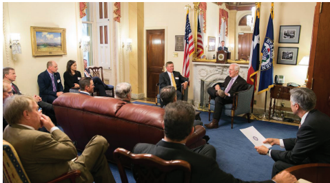
U.S. Sen. John Cornyn talks with leaders from TSCRA and the Texas Cattle Feeders Association about issues important to the cattle industry.

TSCRA will continue working with leaders in Washington in order to protect cattlemen and women who provide food for millions of people worldwide.