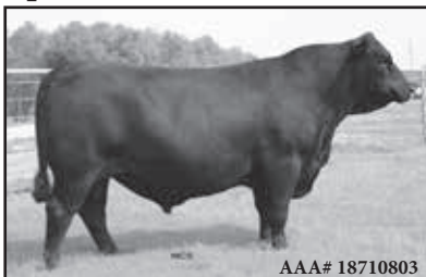
Spur Xtra 6490

FRIDAY, OCT. 26 • 1 p.m. at the ranch, Vinita, Okla.