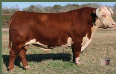
CL 1 Domino 0145X 1ET • 43082486

BW 3.2 • WW 74 • YW 117 • M 27 • US 1.30 TOP 1% TOP 1% TOP 10% TS 1.40 • REA 0.40 • IMF 0.08 • CHB $24 TOP 10%