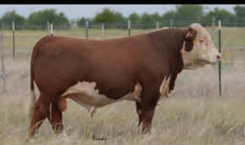
GKB 6928 Cool Kat 6203 ET

SELLING IN THE TEXAS HEREFORD FALL CLASSIC ON OCTOBER 17, 2018 IN BUFFALO, TEXAS