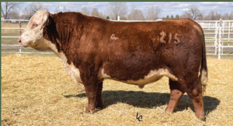
CL 1 Domino 215Z • 43268007

BW 1.6 • WW 72 • YW 119 • M 24 • US 1.40 • TS 1.40 • REA 0.55 • IMF 0.08 • CHB $28 TOP 15% TOP 1% TOP 1% TOP 5% TOP 1% TOP 10% TOP 5%