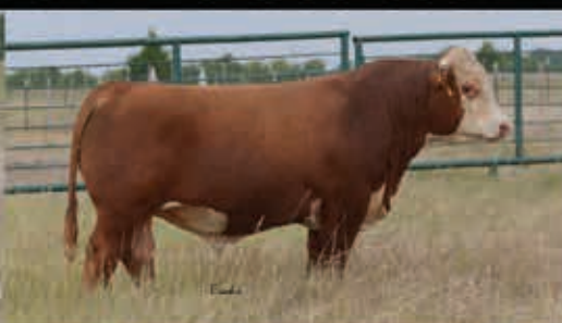
GKB 4282 Hometown 6147