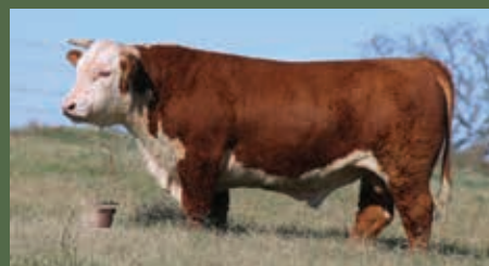
H Advance 6210 • 43683460

BW 3.8 • WW 49 • YW 75 • M 33 • US 1.30 TOP 5% TOP 10% TS 1.30 • REA 0.47 • IMF 0.04 • CHB $27 TOP 15%