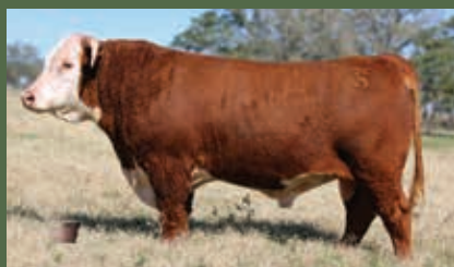
FS Advance 610D • 43681902

BW 5.3 • WW 69 • YW 115 • M 26 • US 1.50 TOP 1% TOP 1% TOP 1% TS 1.60 • REA 0.57 • IMF -0.05 • CHB $30 TOP 1% TOP 10%