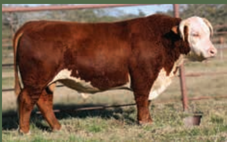
CL1 Domino 5184C • 43575931

BW 1.6 • WW 72 • YW 119 • M 24 • US 1.40 • TS 1.40 • REA 0.55 • IMF 0.08 • CHB $28 TOP 15% TOP 1% TOP 1% TOP 5% TOP 1% TOP 10% TOP 5%