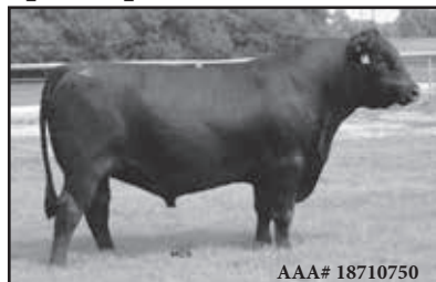
Spur Capital 6326