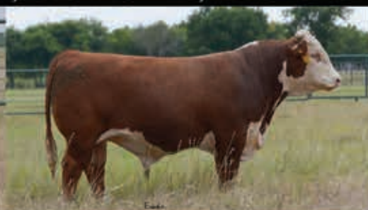
GKB 4282 Hometown 6221