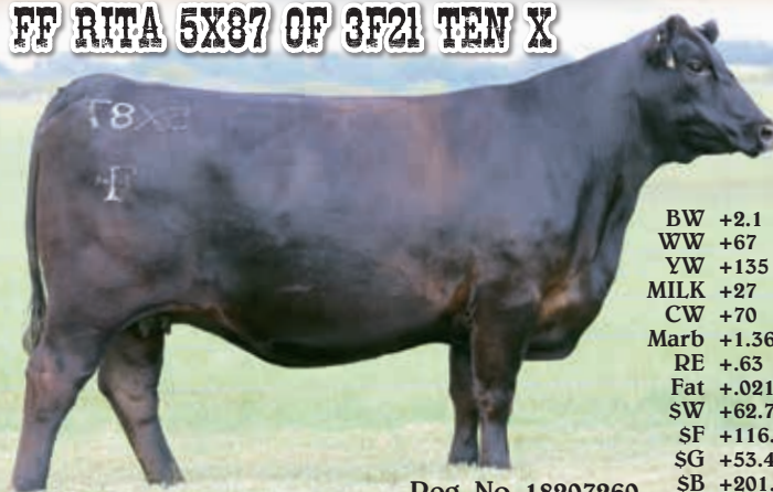
Reg. No. 18207260

BW +2.1 WW +67 YW +135 MILK +27 CW +70 Marb +1.36 RE +.63 Fat +.021 SW +62.77 SF +116.71 SG +53.40 SB +201.80