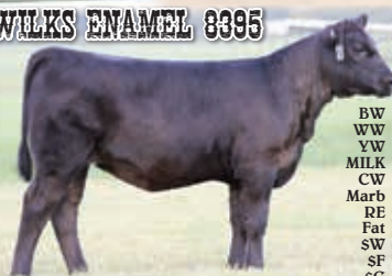
Reg. No. 19140816

The first offspring to be offered to sell by the famed $120,000-valued Bar LR Ivory Enamel 242, who is a daughter of the Pathfinder® sire Hoover Dam and out of an All-Around dam back to the $200,000 donor dam Enamel 8528. This female is the number 4 $B and number 24 for yearling weight among all Acclaim non-parent females in the breed. She is flawlessly designed in her makeup with abundance of red meat and bone. Her EPD profile places her in