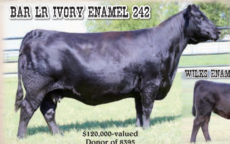
$120,000-valued Donor of 8395