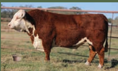
CL 1 Domino 330A 1ET • 43379783

BW 2.3 • WW 56 • YW 81 • M 35 • US 1.30 TOP 5% TOP 10% TS 1.40 • REA 0.34 • IMF 0.14 • CHB $31 TOP 10% TOP 20%