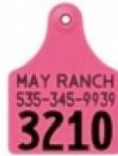
Maxi Layout 4 Management code and 2 lines of text on front