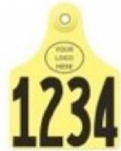
Maxi Layout 5 Management code and logo on front