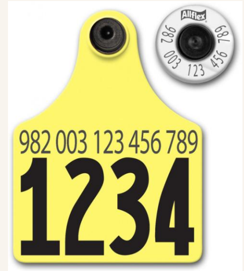
Matched Pair Tag