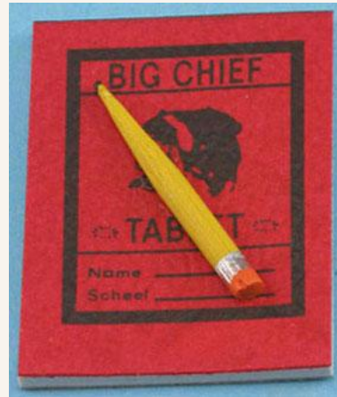
Pencil and Paper