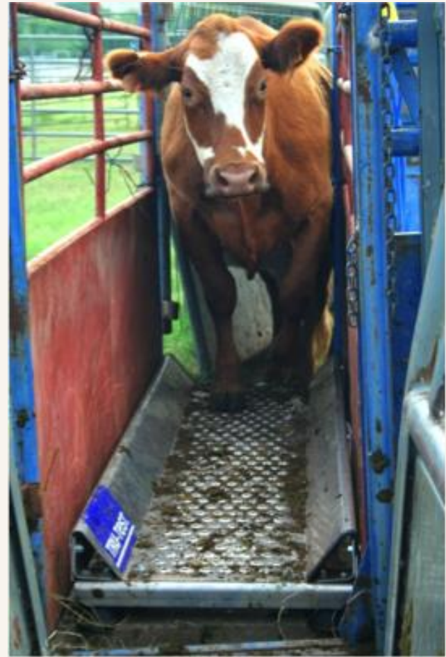
Under a Platform (Portable)