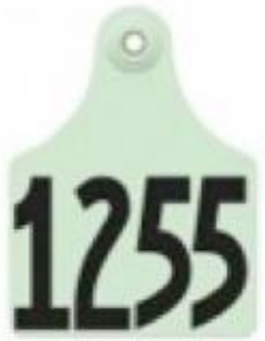
Maxi Layout 1 Management code on front