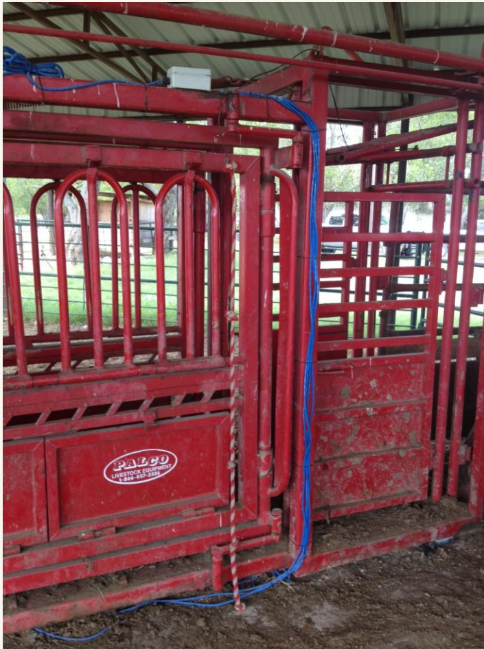
Under a Squeeze Chute (Permanent)