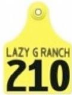
Maxi Layout 3 Management code and line of text