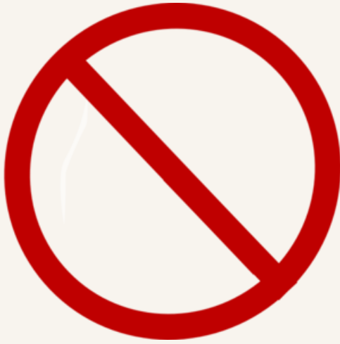
Not at All